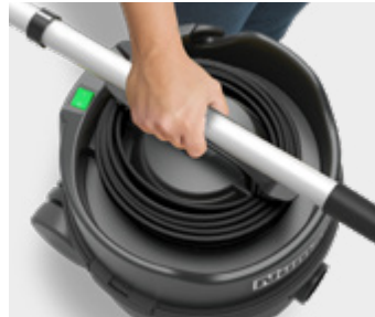
Convenient Carry Handle and On-board Cable Storage