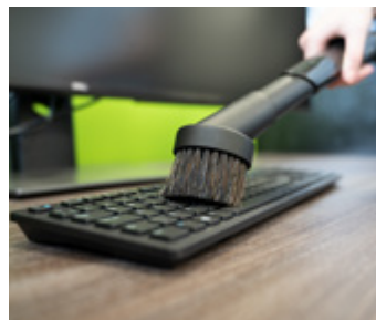
Genuine High-quality Numatic Accessories