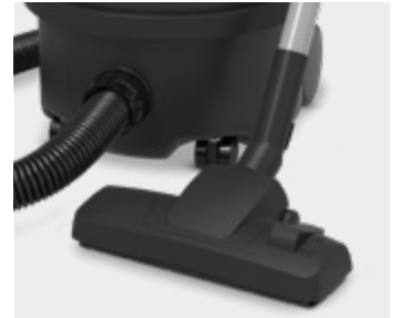
Multi-surface ProFlo Floor Tool